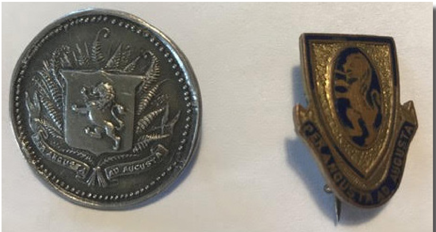
Auckland Grammar School Prefect badge on left and Epsom Girls Grammar School Prefect badge on right