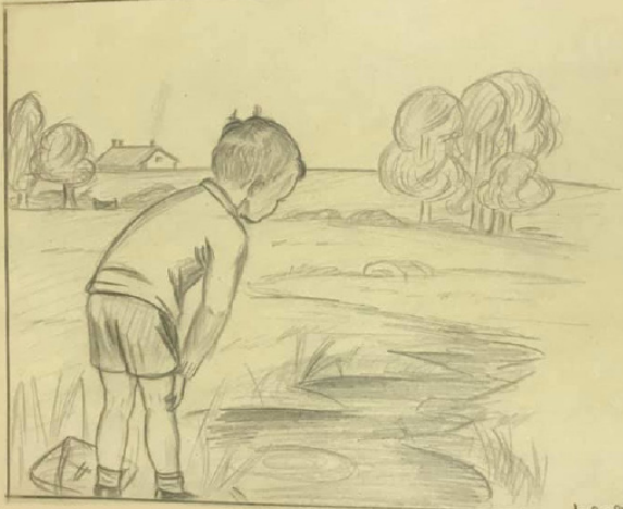
The Walk To School