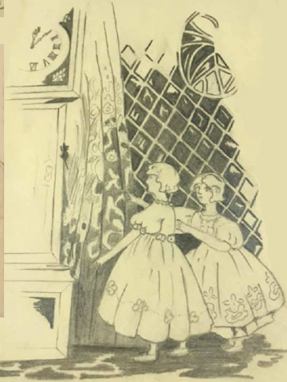
HICKORY, DICKORY, DOCK, THE MOUSE RAN UP THE CLOCK