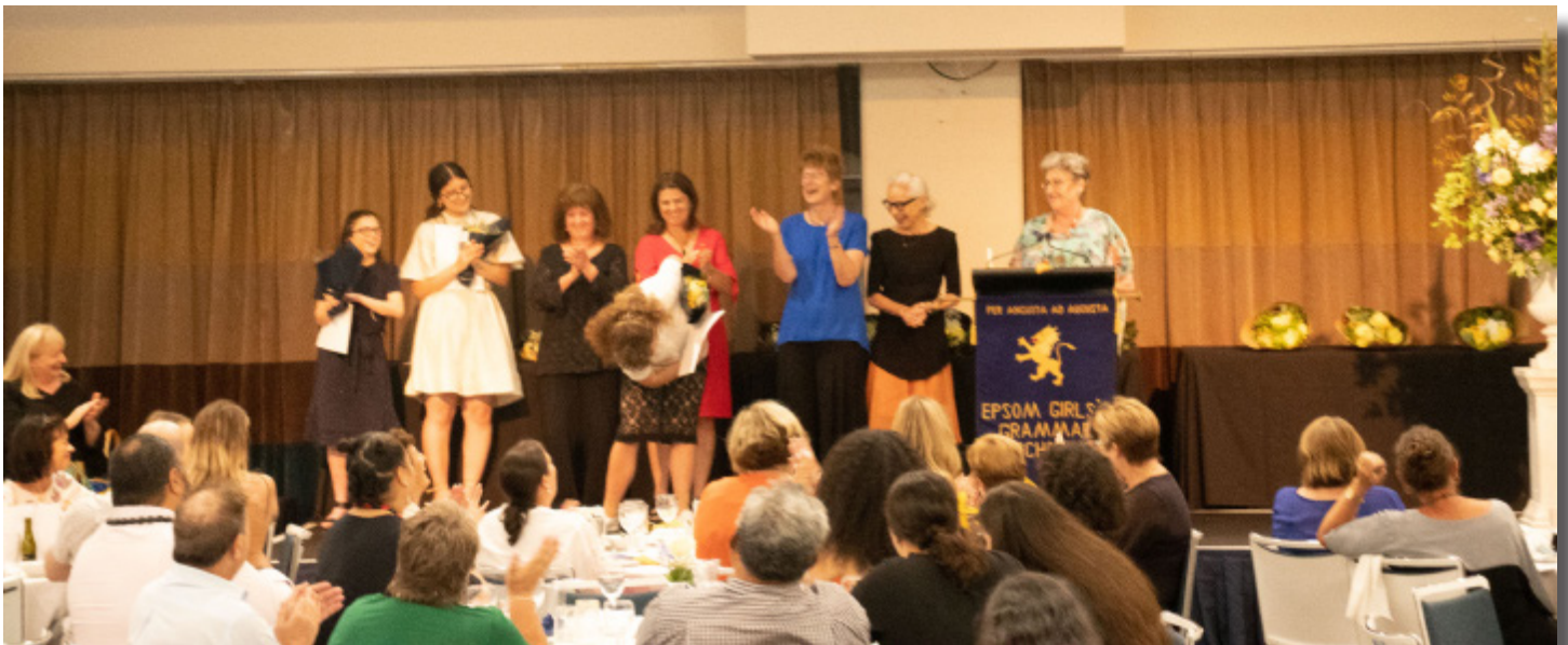
Presentation of the OGA Scholarships:

Each year, the OGA awards special Scholarships of $600 each to girls who have shown qualities such as kindness and consideration for others, honesty, reliability and abilities at a range of activities such as sports, or art and cultural activities, as well as academic work. This year we awarded three well-deserved Scholarships. The girls are chosen by the Year 13 Deans and do not know who they are until announced on the night, so this adds an element of anticipation and intrigue.